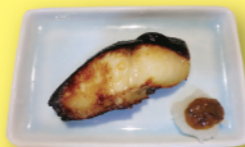
Grilled sablefish seasoned with sweet rice wine