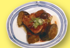
Eggplant miso stir-fry