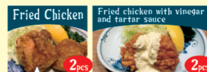
Fried Chicken 2pcs

with special soy sauce each ¥180 (tax in)