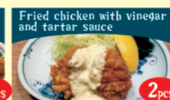
Fried chicken with vinegar and tartar sauce 2pcs