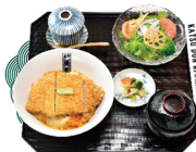
KATSU DON KIWAMI

Two ways to eat: DON and TAICHAZUKE. Try both!!