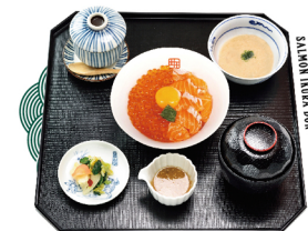
SALMON IKURA DON

Small bowl (GRATED YAM), HON NAMA MAGURO TEKKA DON, Japanese steamed egg custard, Miso soup, Pickles