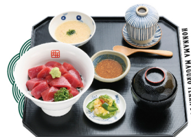
HONNAMA MAGURO TEKKA DON